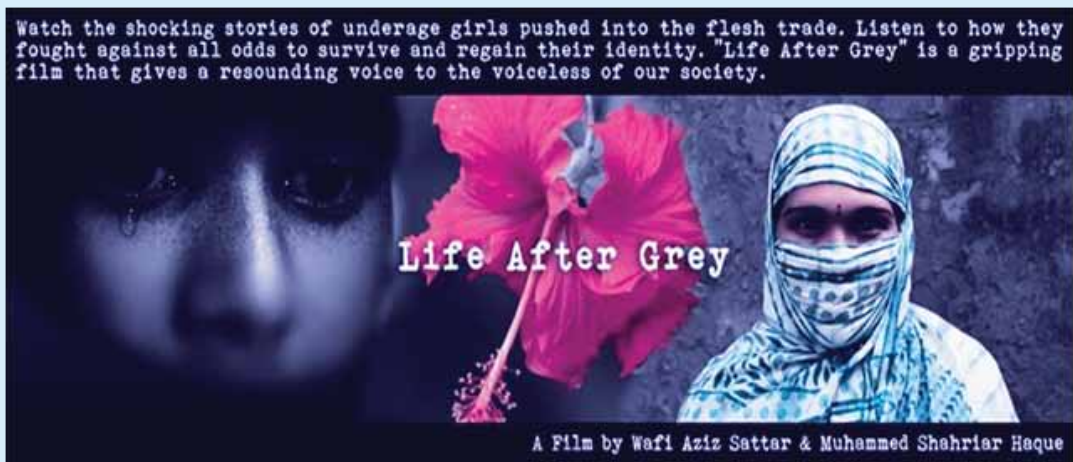
Figure 1: Poster of Life after Grey (Sattar & Haque, 2015)

Watch the shocking stories of underage girls pushed into the flesh-trade. Listen to how they fought against all odds to survive and regain their identity. Life after Grey is a gripping film that gives a resounding voice to the voiceless of our society.